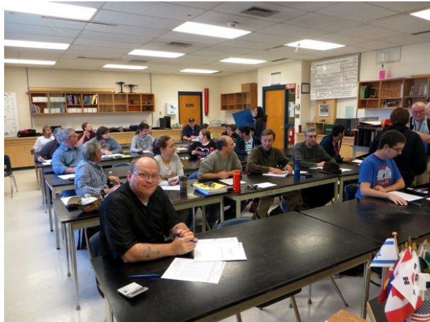
21 students ready to write Basic Exam

Congratulations to all those students for working so hard to pass. Listen for those new call signs and welcome them to our hobby.