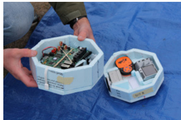
The Science Module

I was shocked. See attached. The first hour and a half the sensor was on the ground. Temp decreases with altitude in the troposphere and increases with altitude in the stratosphere. We need to make a temp - altitude plot. As I said the meteorologists would probably find this interesting. I was very surprised by the high temps recorded way up there.