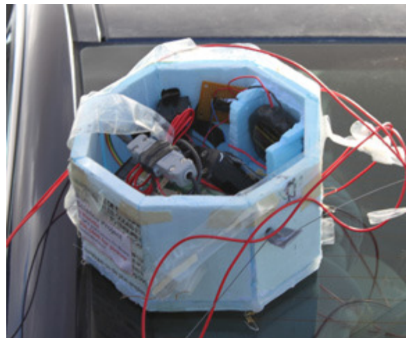
The Corn Module Recovered