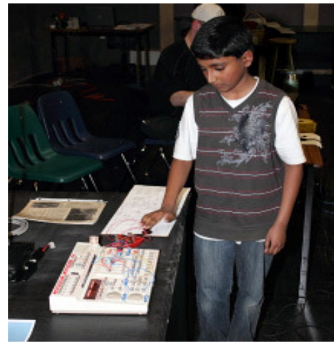
With obvious understanding and confidence he described it's operation and then demonstrated it with a good fist. Well done!