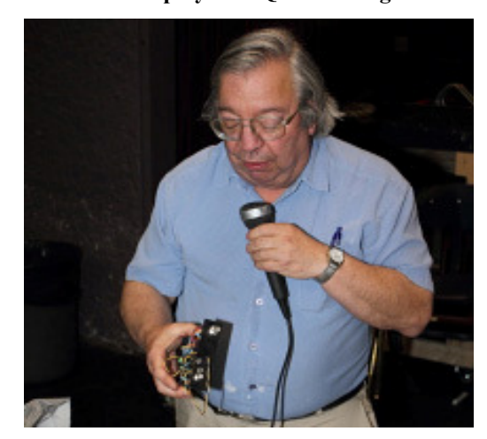
Most impressive was Sapun's VE4WSP project: a neatly constructed and very well illustrated CW oscillator.