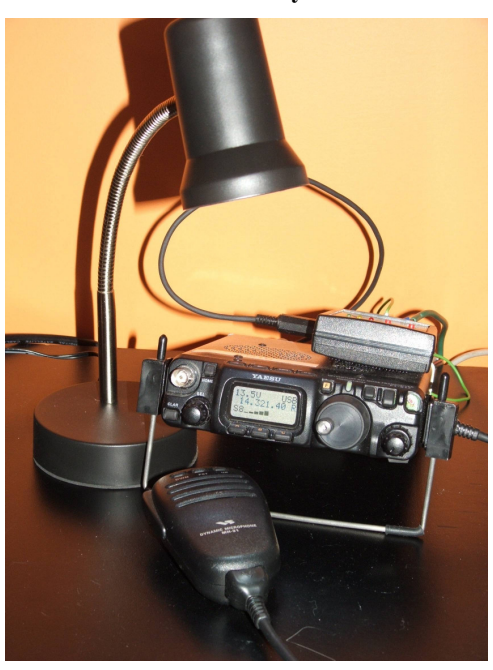
Figure 2 All PowerPoled and in use (the flash has nullified the pool of light from the LEDs though)

It was quickly modified by removing the plug in power supply and installing a pair of PowerPole connectors so now I've got a nice little light for the shack, field day (no tubes or bulbs to break) or even in my car while parked. (I suppose addition of some Velcro to the base and my dashboard would allow it to be used while mobile). It's low current draw makes it a good match with a QRP rig on a battery.