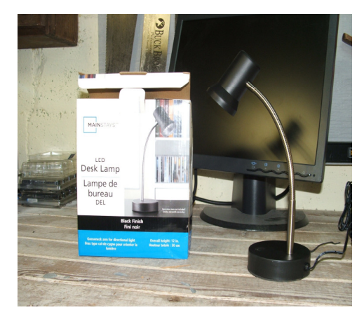
Figure 1 Out of the box but not yet modified

Recently I found myself wandering the aisles of my local Wal-Mart when I came across an LED Desk Lamp. The thing that caught my attention was that it was powered with a 12VDC power supply and drew a measly 250mA.